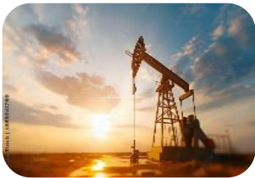
Petroleum and Water Drilling