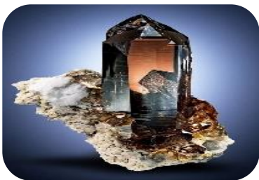
Mining & Minerals