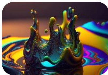
Paints, Inks, Coatings