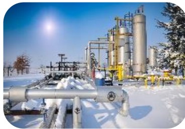
Grease & Lubricants Plants