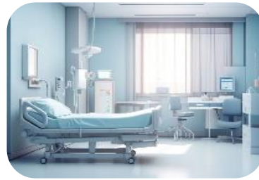
Medical & Healthcare