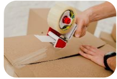
Adhesives & Packaging