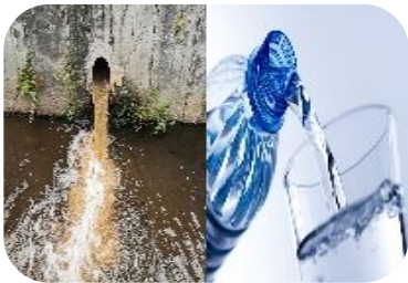
Waste and Fresh Water Treatment