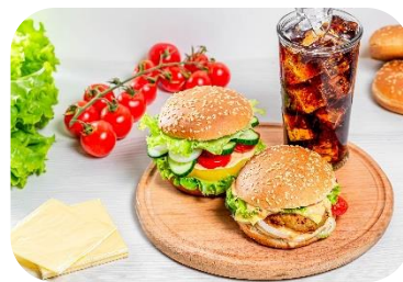
Food & Beverage